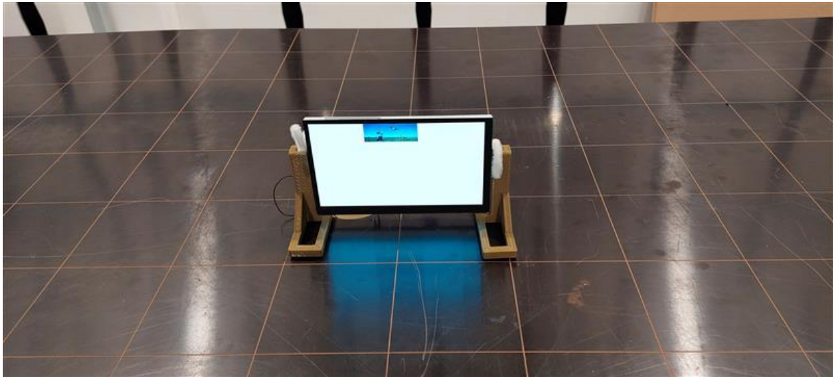
Figure 1. Radiation Emission 30-1000MHz Test Front View