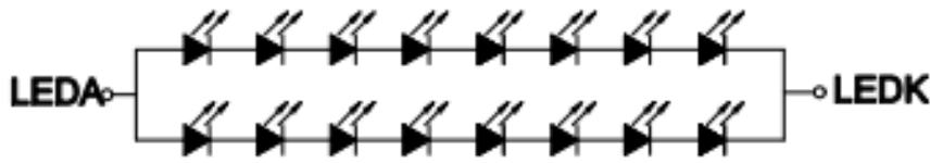
LED Diagram Circuit

Internal backlight circuit of Riverdi HB, IPS 4.3" Series is built with 2x8 (8LEDs in a row) LED matrix.