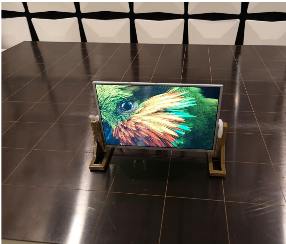
Figure 1. Radiation Emission 30-1000MHz Test Front View